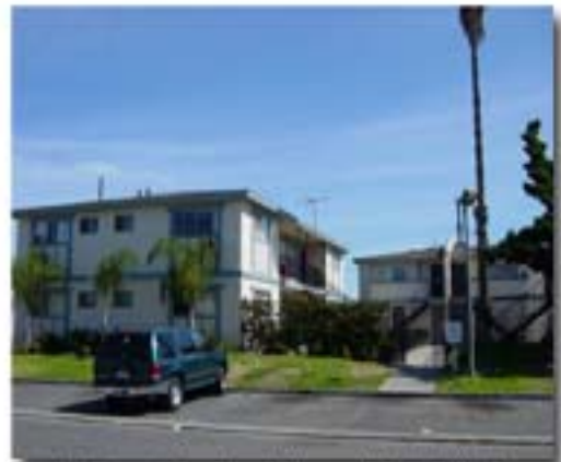
Jamboree #2 - Acquisition and Rehabilitation