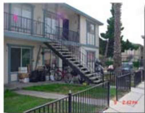
Jamboree #1 - Acquisition and Rehabilitation