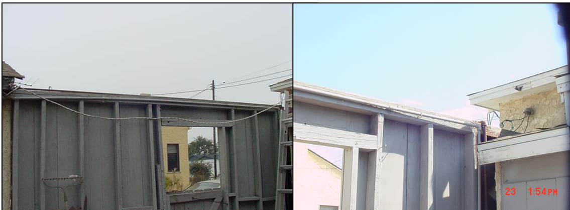
Code enforcement activity resulted in the correction of substandard electrical work at this residence that was a serious safety hazard.

Code Enforcement (SL-3): Code Enforcement in the City's targeted Enhancement Areas has proven to be an important means to alleviating the blight in distressed areas. In August 2007, City Council approved a resolution for the new "designated areas" for Special Code Enforcement. These areas met the definition of "deteriorating" or "deteriorated area." CDBG funds were used for the special Enhancement Area Code Enforcement Program that includes two Code Enforcement Officers (equivalent to 4,160 staff hours). Additional Code Enforcement Officers are funded from the City's general fund. This program has the authority to enforce the housing codes (law), followed up by the assistance of the Housing Rehabilitation program to help income-eligible households with making code corrections and improvements. Code Enforcement Officers also conduct community outreach for neighborhood improvement. The enforcement of the housing codes assists tenants and property owners maintain a suitable living environment.